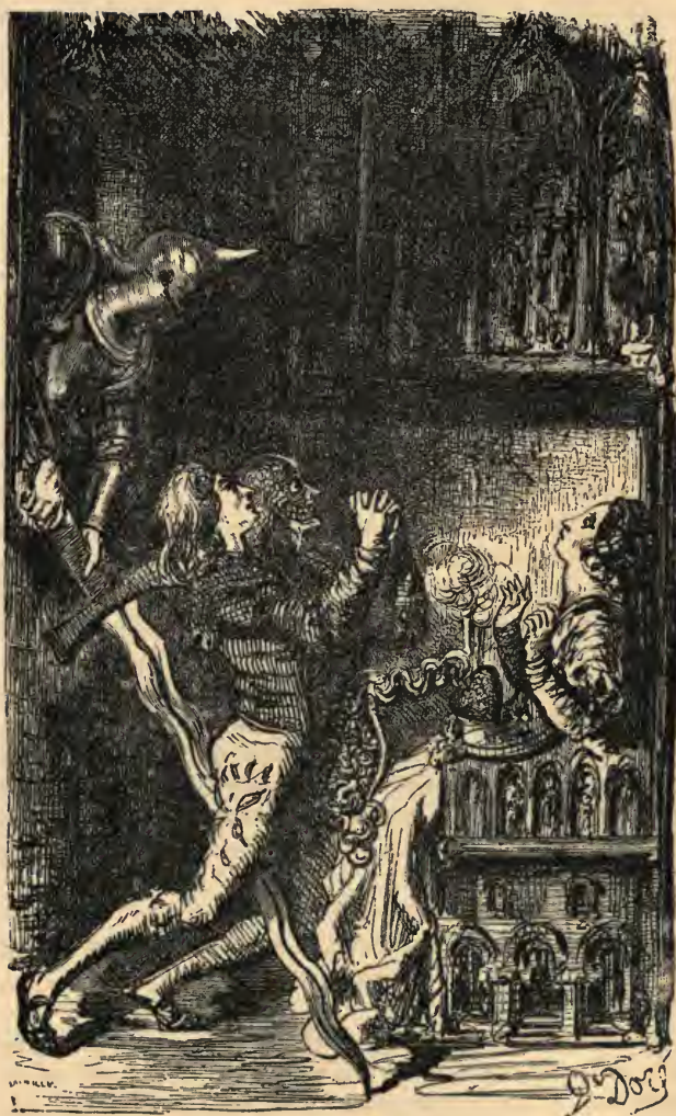
The sword of a husband is a pleasant death for a gallant, if there be pleasant deaths.